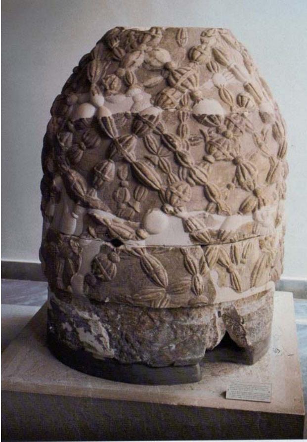
▲ 30 The 'Omphalos' or 'Navel of the World'. This copy, in the Delphi museum, comes from Roman times. The original had precious stones at the points of intersection.